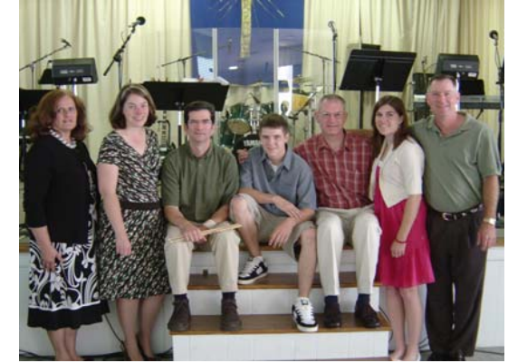
Hearts of Worship

Hearts of Worship plays at the 8:45 AM Contemporary Service. The band was formed in the Spring of 2000, when CUMC added the Contemporary Worship Service. The band is comprised of Guitars, Keyboards, Drums, and Vocalists.