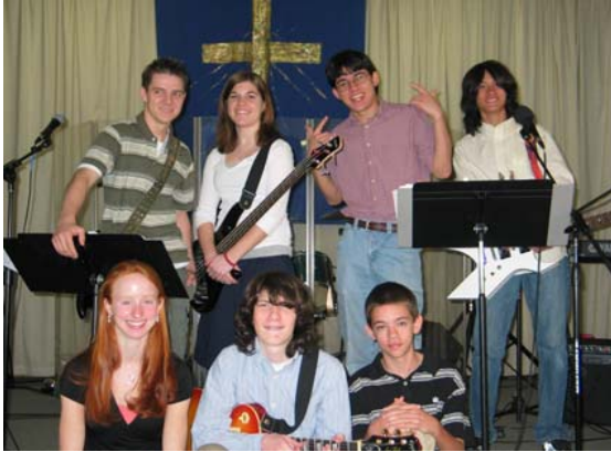
CUMC Youth Praise Band

The Youth Praise Band plays at the 8:45 AM Contemporary Service one Sunday each month. The band is comprised of Youth from CUMC who enjoy Contemporary Music with a youthful twist. The Youth Band has performed at multiple Coffee House Nights in Fellowship