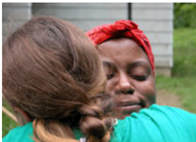
A volunteer is given a hug as a show of appreciation.

As a way to fund these types of local ministries, the VIM group holds several Pancake Breakfasts during the course of the year (Valentine's Day, Mother's Day, Fall Flea Market, and Christmas). These Pancake Breakfasts are located in Fellowship Hall and are open to the general public.