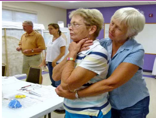
CUMC recently hosted CPR & First Aid Certification Training Classes

"And the prayer offered in faith will make the sick person well" James 5:15