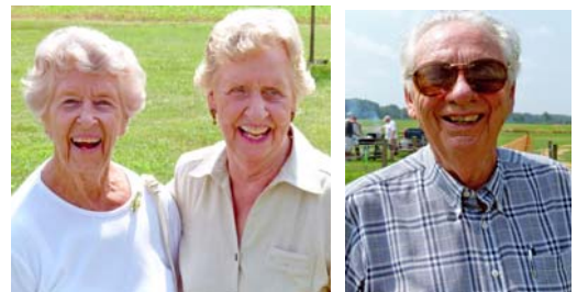
Annual Church Picnic and Worship at Camp Pecometh on August 7